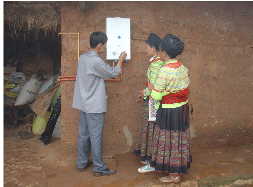
Villagers learn how to use bio-gas as a fuel source for cooking supplied by small-scale anaerobic digesters.

More detail on how carbon crediting programs seek to ensure the quality of carbon credits (along with some of their limitations) can be found in Section 4 of this guide.