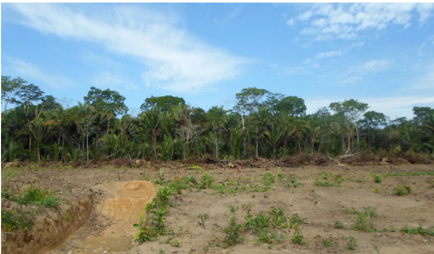
Forestry-based crediting projects have the potential to shift deforestation from the project location to unprotected areas causing project leakage to occur.