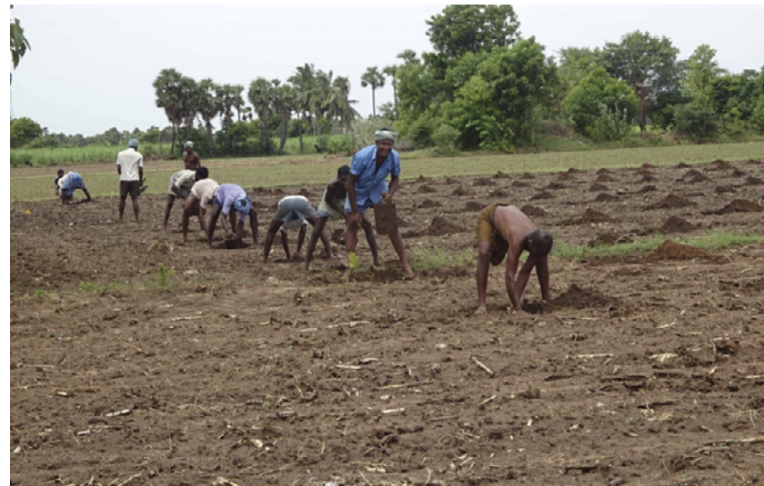
Agriculture-based carbon credit projects can create job opportunities through increased management intensity.