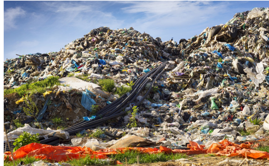
Sometimes GHG reduction activities are required by law. Landfill operators in California, for instance, are required to install equipment that captures and destroys methane.

Suppose that, for every 50 additional tonnes of CO 2 emissions that are avoided by a crediting project, the project developer reports avoiding 100 tonnes, and 100 carbon credits are then issued to the project. Half of these credits would have no effect in mitigating climate change and using them instead of reducing inventory