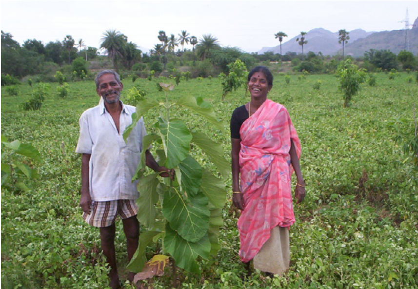
Tree planting carbon crediting projects can provide many co-benefits to local communities.

questions may be difficult. Thus, in Section 5 , we identify a range of strategies buyers can use to steer clear of lower-quality carbon credits and improve the chances of acquiring higher-quality credits.