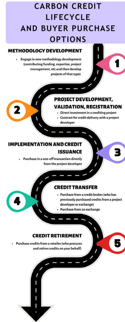
Figure 2. Carbon credit lifecycle and buyer purchase options at each stage

Another option is to purchase carbon credits on an exchange. There are multiple environmental commodity exchanges that list carbon credits for sale and work with registries to enable transfers. Purchasing carbon credits on an exchange can be relatively quick and easy, but it can be harder to obtain the information needed to evaluate the quality of these credits.