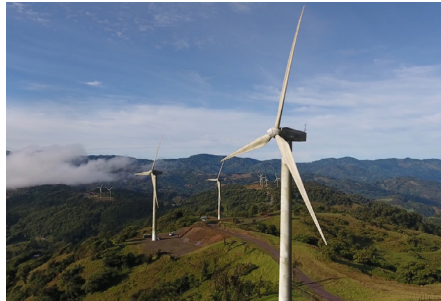
Renewable energy carbon credit projects like this wind farm, must be highly scrutinized for their additionality and the role of potential carbon credit revenue incentivizing the project to occur.

In practice, carbon crediting programs can also apply approaches to determining additionality for some project types that blend elements of both project-specific and standardized methodologies.